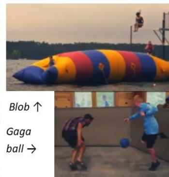
Blob ↑ Gaga ball →